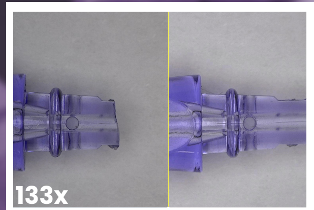
Moulded polymer image comparison